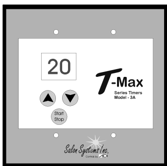
Front View of T-Max® 3A

J4 - PWR IN 9-12V: Connect 9-12V power supply to this terminal. J3 - Contact: Connect the two wires from the tanning bed to these screw terminals. J6: Connector to connect external speaker for higher volume alarm.